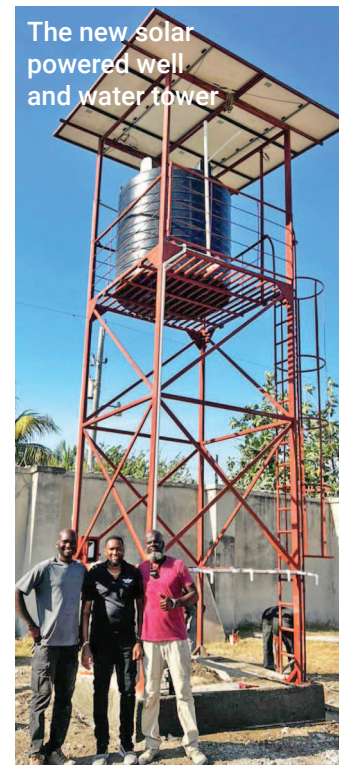
The new solar powered well and water tower

Please keep the new preschool in prayer. We are hopeful and excited to see all that the Lord will do.