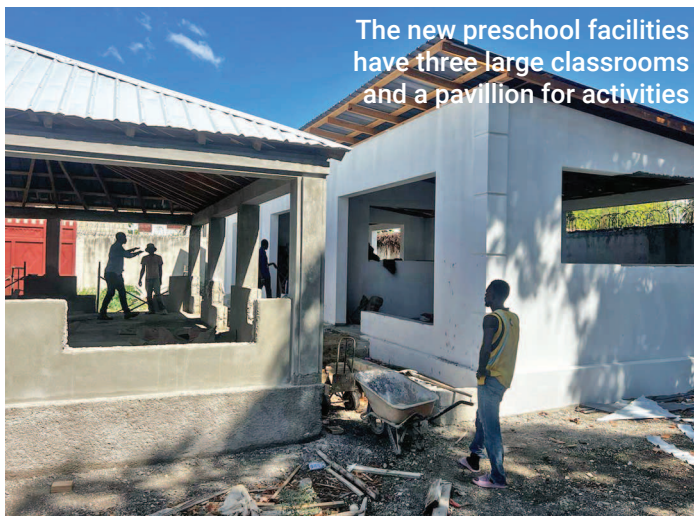
The new preschool facilities have three large classrooms and a pavillion for activities

Our plan is to launch the new preschool in September. We are now calculating the costs for the supplies, materials and furniture to start. Those figures should be ready soon.