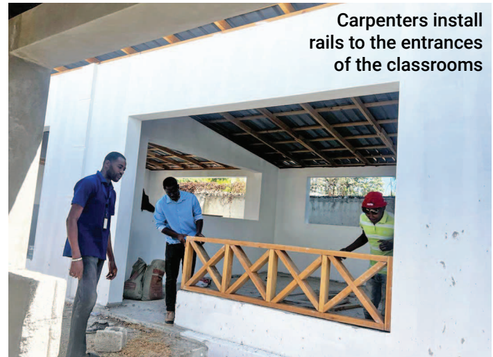
Carpenters install rails to the entrances of the classrooms

The new solar well is complete and working great. In order to distribute fresh water to the new preschool, the well drillers built a 20 foot tower with a thousand-gallon tank. The two large solar panels make sure that the solar pump always keeps the tank full. As the new preschool gets started and more facilities are built, this well will supply fresh water for years to come. Jean and Pitterson, the two young men who drilled the well did a great job.