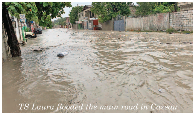
TS Laura flooded the main road in Cazeau

Your Founders' Challenge offerings allow us to serve under God's protection. We have received $20,656 so far this year. We need $65,000 to cover our Operating Expenses in Haiti. Your offerings large and small make this work possible.